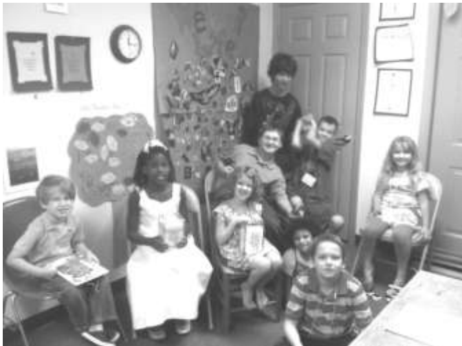
RE kids from UU Valdosta and Serenity Christian Church with their shared service project in mid-July.