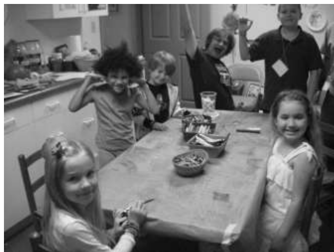
RE Kids in November

Adult Religious Education: The fall series has been discontinued for now. Watch for a possible continuation sometime in the future.