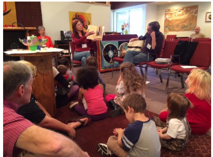
Story for All Ages