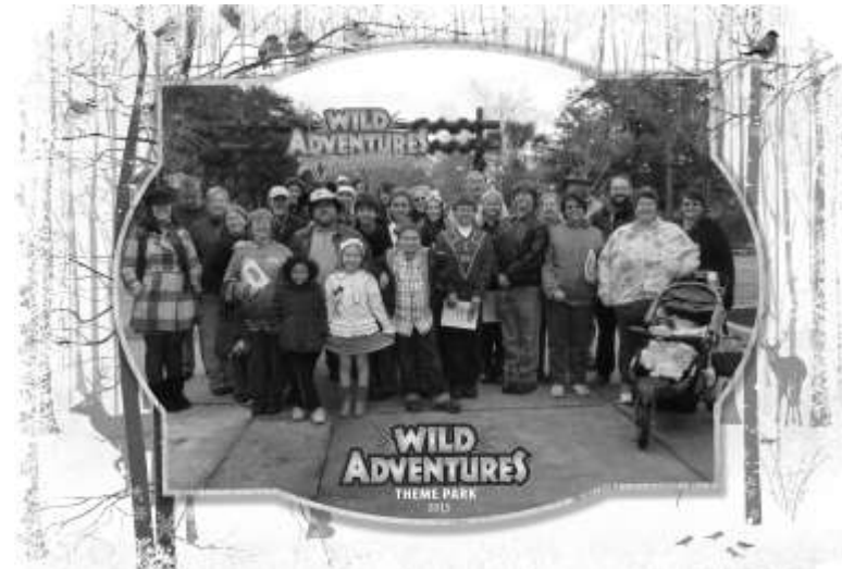
UU Valdosta caroling at Wild Adventures on a cold damp Sunday in mid-December!

MountainCamp and MountainCONS are of course scheduled, as is Family Camp. The 3rd Annual Southern Unitarian Universalist Fall Institute is October 6-9. Click here for the 2012 SUUFI Yearbook.