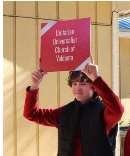
Carrying the sign identifying our group at Wild Adventures, Dec. 14, 2014