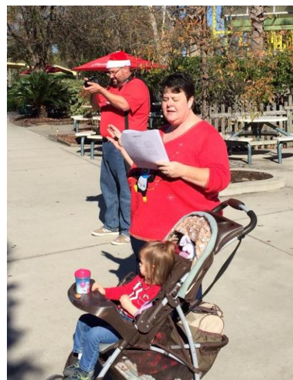
UU's at Wild Adventures Dec. 14, 2014