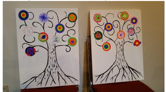
RE - shared service art project