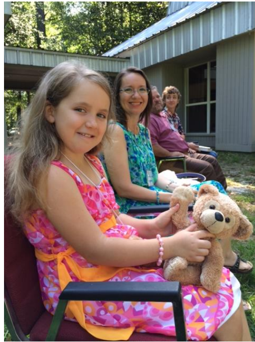
ENJOYING THE OUTDOOR SERVICE!