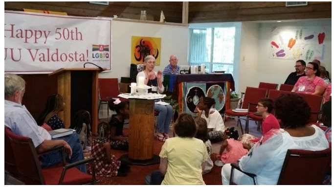
Story for All Ages, during the Shared Service with Serenity Christian, May 15, 2016.