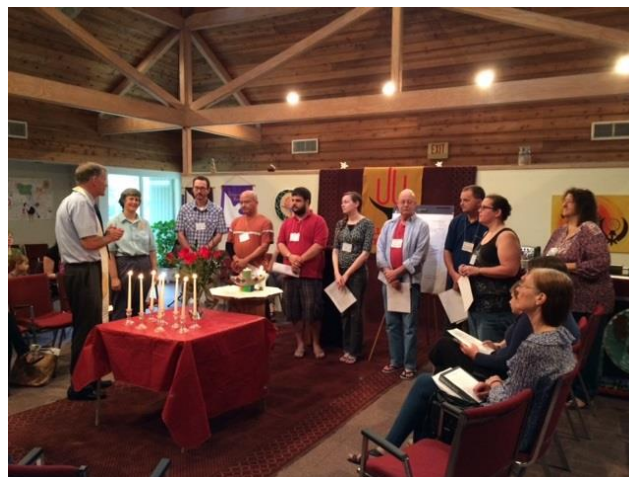
New member ceremony, April 19 th

The KTD Buddhist reading and meditation group meets on Tuesday evenings at the church. Everyone interested in Buddhist practice and meditation is welcome. Tea, 5:30-6: Buddhist shamata meditation, 6-6:30; Discussion of reading, 6:30-7.