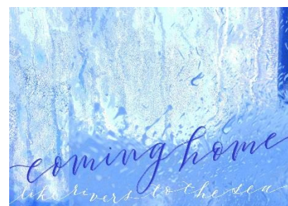
Image by Cathleen Young, commissioned by Harvard Square Library to commemorate the original water ritual.

Today, we will re-visit the original water ritual. Each person in attendance will have an opportunity to add water to the communal bowl and share a brief message about the personal significance of the water shared.